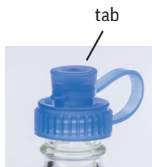
Reclosable bottle cap adapter