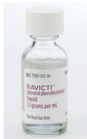
Bottle of RAVICTI